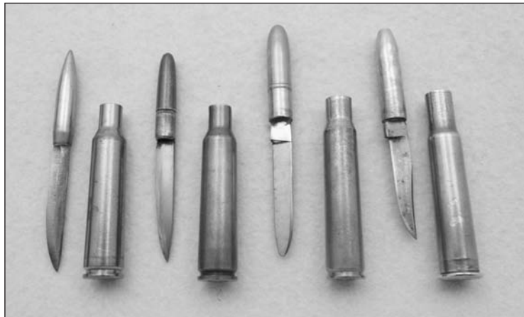
L to R - WAC 6.5x55 Swedish - Herters Custom 6.5x55 Remington 9mm - R-P 30-40 Krag

For the last few months I have been running an ad "Wanted ammo knives." These can also be called cartridge knives, bullet knives or novelty letter openers, if you choose. The older versions of these knives featured a rifle cartridge which, when the bullet is pulled out by hand, had a small knife affixed to the base of the bullet. By turning the bullet around and inserting it into the case, a handy dandy knife would be ready for use. Albeit not your defense knife, but a good letter opener or a fingernail cleaner or ink eraser (if you are old enough to know what that was all about).