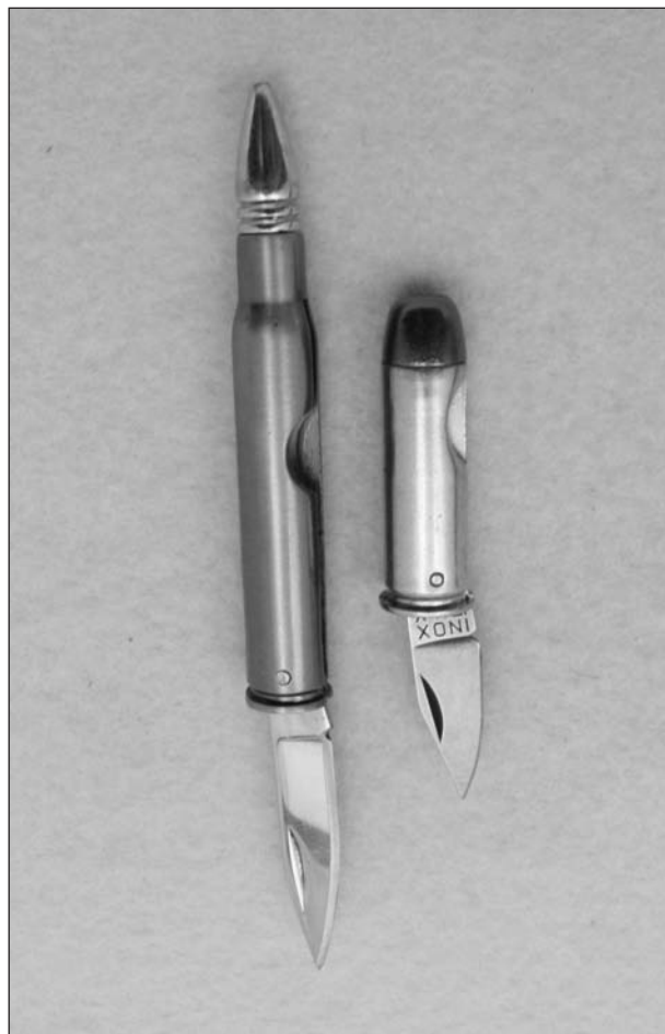
30-06 and 44 Magnum

December Mini Winter Show Table application Date December 11, 2010 Lane Events Center - Pavilion Building - Eugene OR