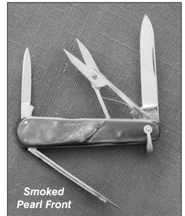
Smoked Pearl Front

I am told that the process for making the black pearl handles is to stain the pearl by soaking it in silver nitrate for several days and then exposing it to sunlight. This is similar to the chemical process used on photographic film.