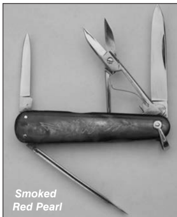
Smoked Red Pearl

Now the mystery to be solved is what is actually engraved on the handle of this knife. I have asked numerous people for an opinion, and the best I have come up with is 41 Jyriepjur. No one has given me an opinion on what the engraving is between that 41 and the potential name and even the 41 and name are up for new opinions. I hope any of you reading this are willing to look closely at this engraving and let me know what you think the engraving says. Please contact me via email at jpitt306@earthlink.net and let me know your thoughts.