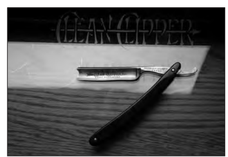
Rector & Wilhelmy razor with Clean Clipper etching on Clean Clipper display case

It has really been fun coming across Rector and Wright & Wilhelmy items as I go through a gun show or flea market; the pursuit is half the fun, and it gives me something else to look for. Hopefully other collectors will now have something else to look for.