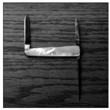
Pearl handled knife

they were located at 10<sup>th</sup> & Jackson Streets for more than a century. In 1884 they began operating as a wholesale hardware company. A merge