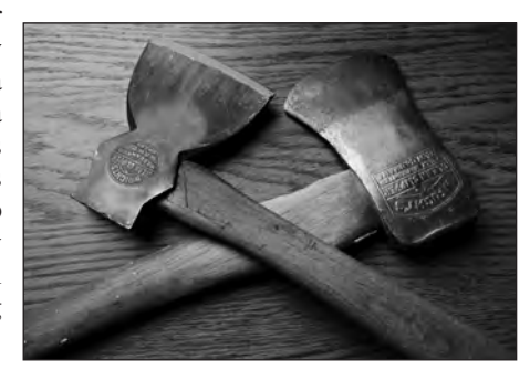
Hatchet and axe head with Wright & Wilhelmy Clean Clipper embossed into head