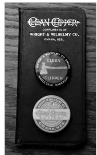
Notebook and advertising pins

I personally dealt with Wright & Wilhelmy in the 1980s when I had a small retail knife outlet. At that time