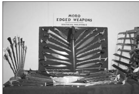
Moro Edged Weapons