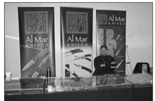
Al Mar Knives