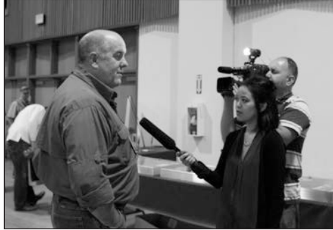
Craig Morgan on TV