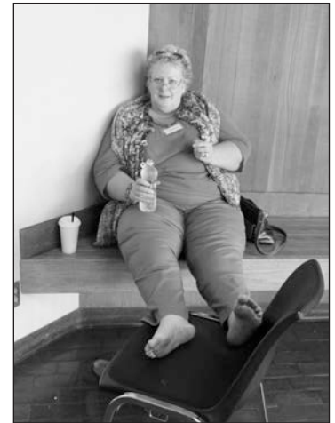
Taking a breather