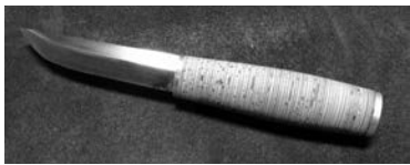
Basic Puukko with birchbark (tuohi) handle

makes the puukko unique and tell a little bit of the story that we don't hear much of here in the states. I would also like to state that I am not a scholarly expert; and if I get something wrong or twist it around a bit because of my own cultural perspective, please forgive me. My intention is only to share a perspective (my own) on what I learned about the traditional puukko, an iconic knife with deep roots in the Finnish culture.