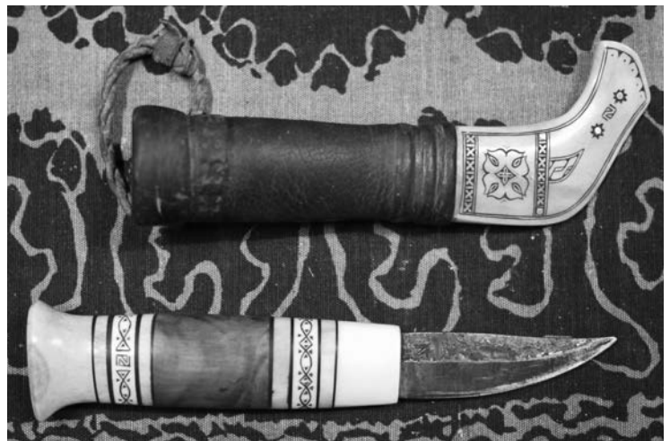
Sami knife (Unna-Niibas)

It should also be mentioned that within Finland there is another group known as the Sami whom today occupy the northern parts of Finland, Sweden and Norway, who have a distinct language and culture and once occupied much more