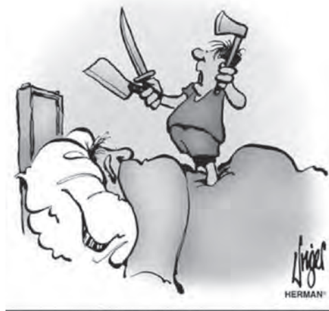
"Dad, watch me juggle!"

After much gnawing and grinding of the teeth, it has been decided that the Holiday Show would not be a good idea. It has been cancelled. Aside from the health issue which is primary, it is hard to envision it would be a well attended event. From table-holders to event attendees, we do not predict a packed venue.