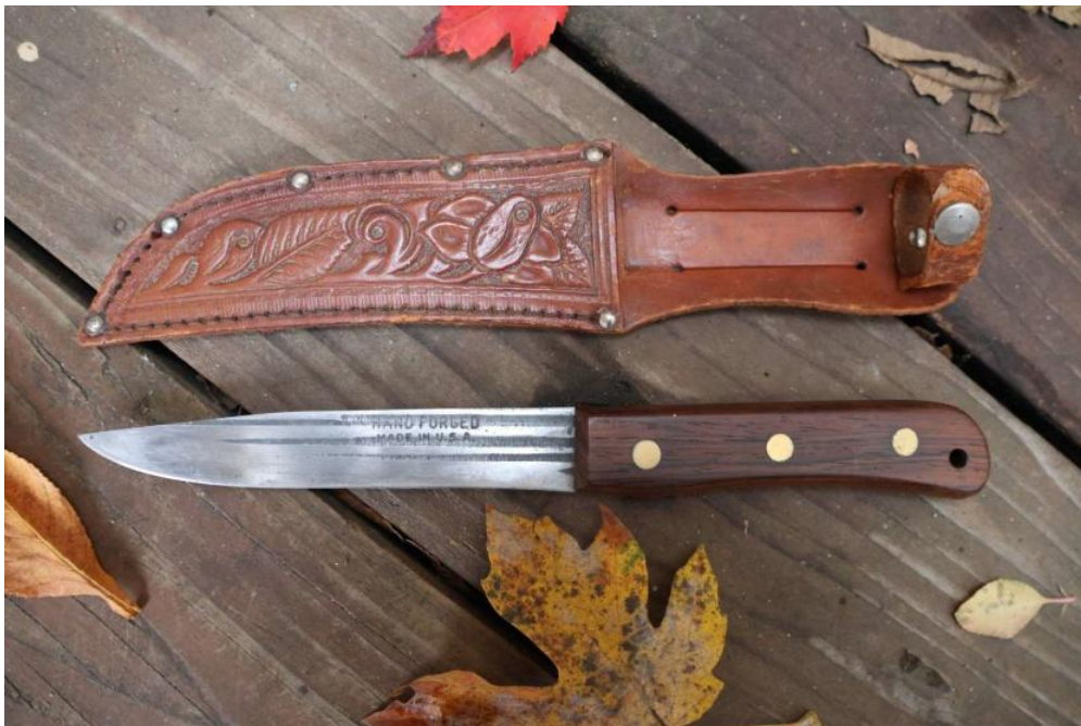
(lost Herter's knife found again)