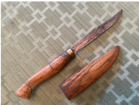
(Dad's knife he made in Holland)

While he was hiding in a barn, dad acquired a couple power hacksaw blade and a file. He had decided he and his crew needed some sort of weapons, so he made several