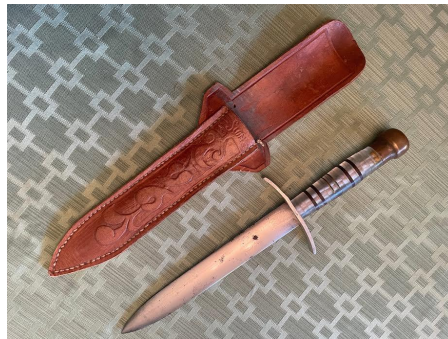
(Dad carried this dagger in the top of his jump boots while flying for many years.)

After returning to the United States, dad was stationed in Honolulu Hawaii while the pacific theater was still active. He made several knives from military aircraft parts, plexiglass windshields and red light covers and pieces of aluminum.