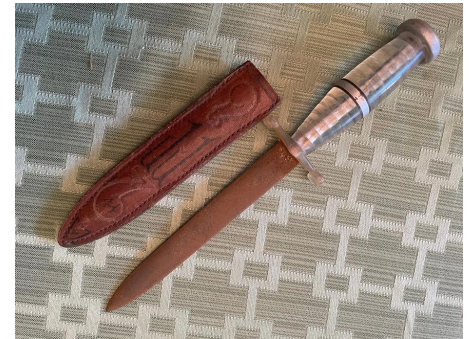
(Dad made this knife for my mother)

This blade has a fine, even coat of rust so it may not have been made with a planer blade.