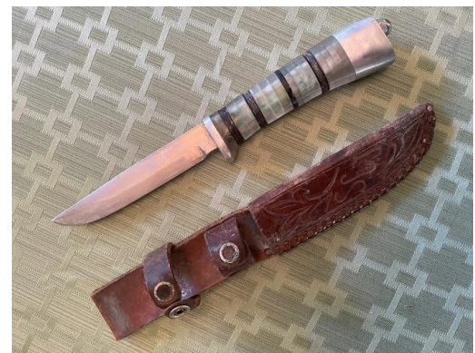
(Dad's hunting knife)

The third is a hunting knife he made at the same time. This was the only hunting knife I ever knew dad to carry and use. The power planer blades he used held an edge and this one is sharp to this day.