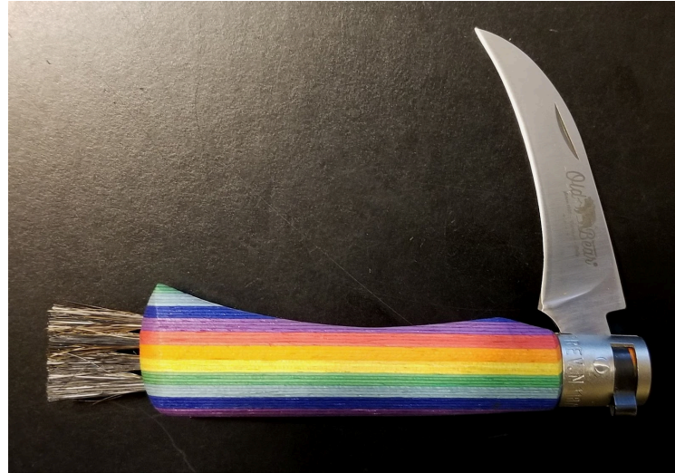
(figure 2 above)

Can a KNIFE be racist? People can be offensive, without a doubt. But is it possible that a metal and plastic