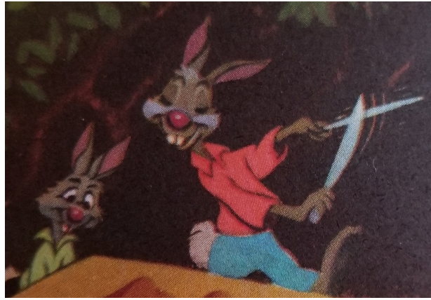
(figure 3 above)

I have great Mushroom-hunting Knife with a rainbow colored handle – does that mean it belongs to the LGBTQ+